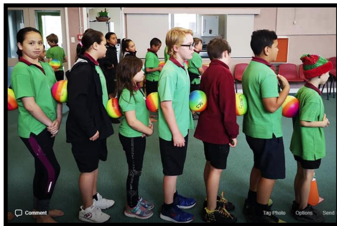
Kahikatea taking part in a team building exercise