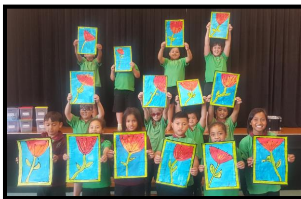
Room 8 showing us their art in assembly