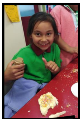
Last Friday Kowhai team had a Teddy Bears Picnic and made Fairy Bread