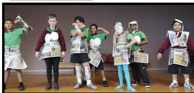
Kahikatea took part in a Newspaper Fashion STEM challenge