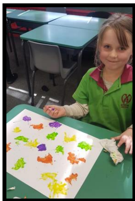
Room 8 have done some 'Germ Art'