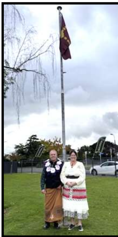
Flag raising & closing ceremony

If you have already paid your sports fees, nga mihi nui/thank you.