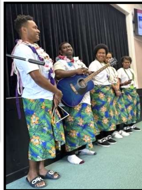
Rotuman Language week